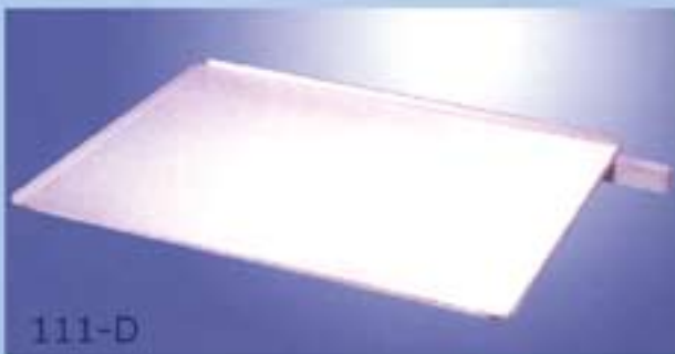
Suction Catheter holder